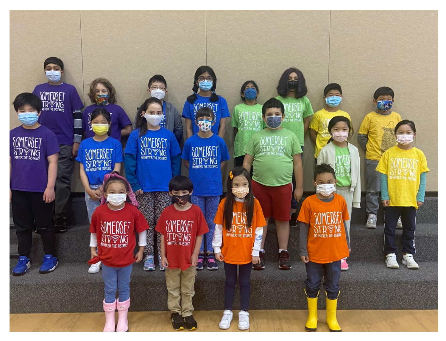
K-5 students celebrated school spirit by wearing their grade's color